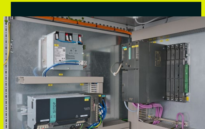
24V DC power distribution and SIMATIC S7 PLC

How can all key personnel at the mine become familiar with the GMD and its components in the most efficient and flexible way? How can they build up and retain the sustainable expertise that helps create a safe and efficient operation? How can they learn to deal confidently with unexpected faults and improve reaction times in emergencies before they are actually confronted with these situations? Answering these questions is crucial for reducing shutdown time to a minimum - and for fully leveraging the inherent best-in-class availability of GMDs from Innomotics.