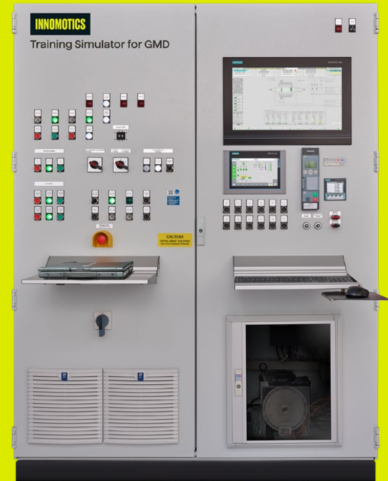
The Training Simulator is available based on PCS7 (see image above) and on TIA technology (see image on the brochure front cover).