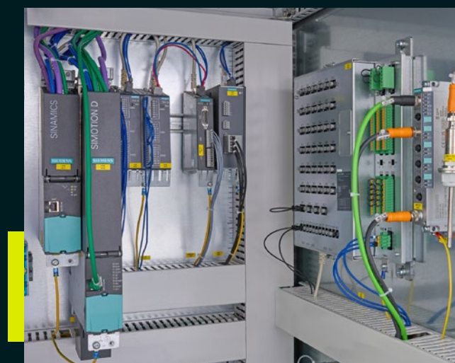
Drives CPUs and PSA

A dedicated training plan covers all operation and maintenance activities and leads participants through each training area with specific exercises for each activity.